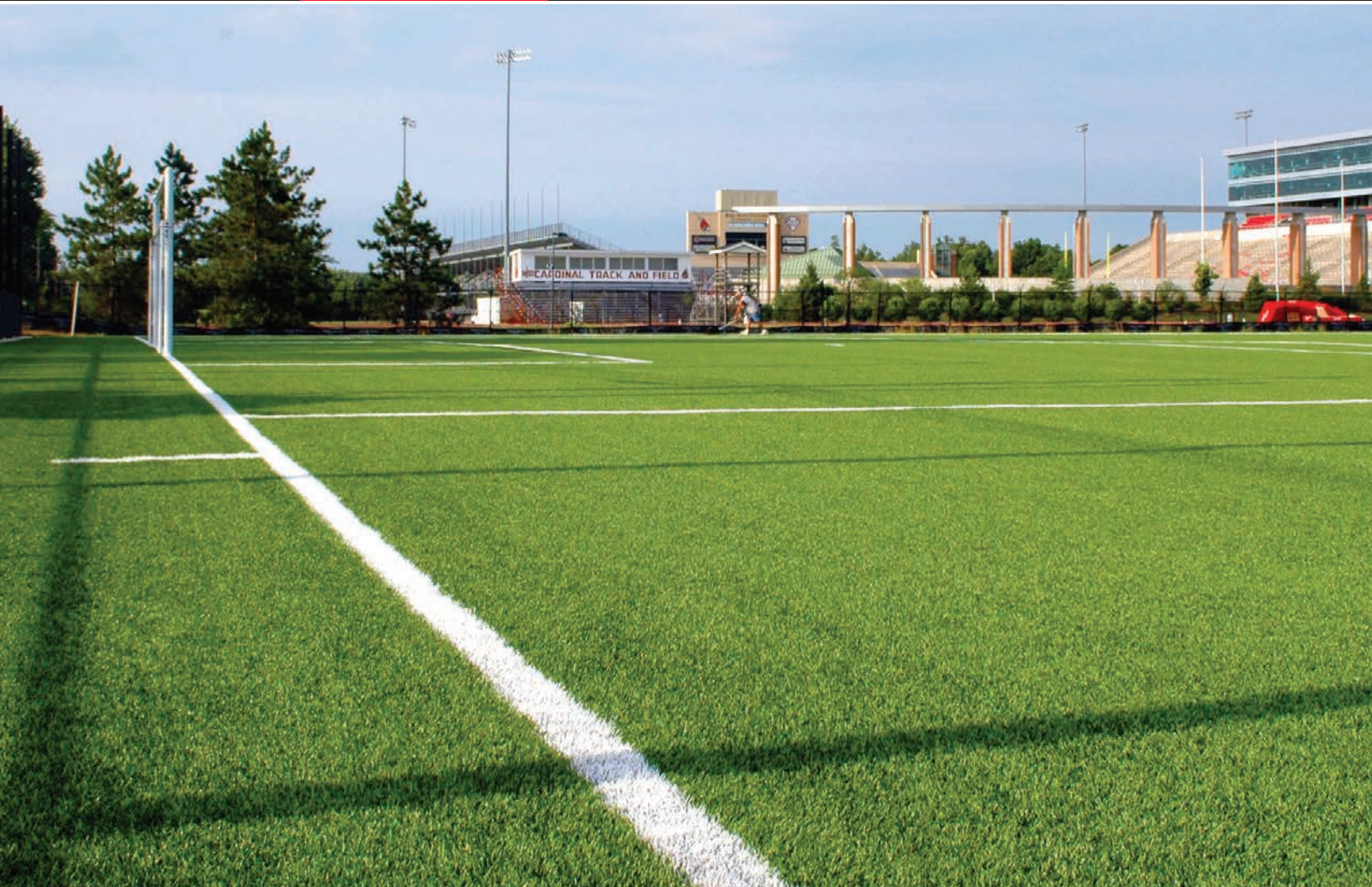
A-Turf® Mono soccer field at Ball State University – Muncie, IN.