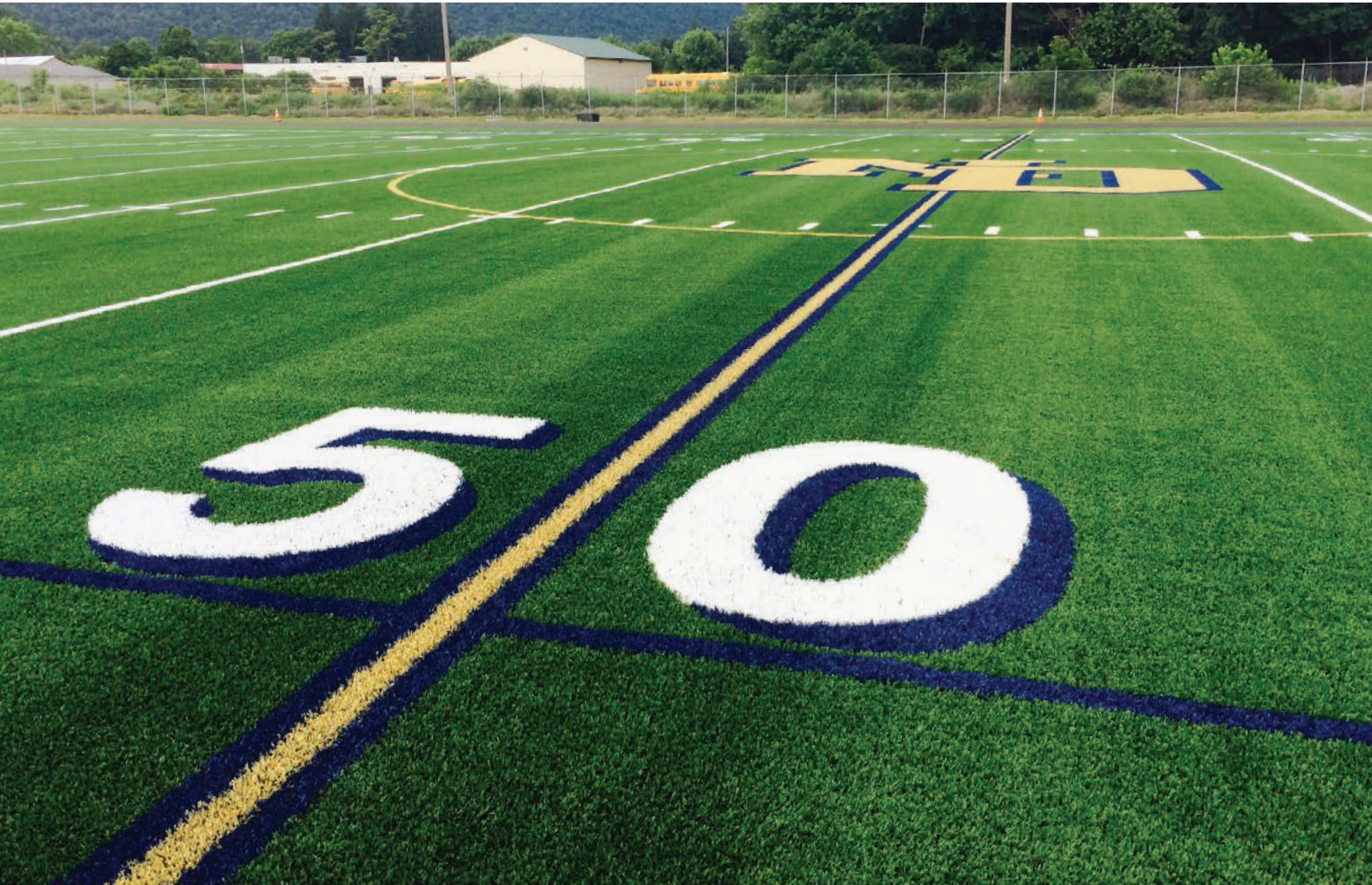
A-Turf® Premier XP field at Notre Dame High School – Easton, PA.