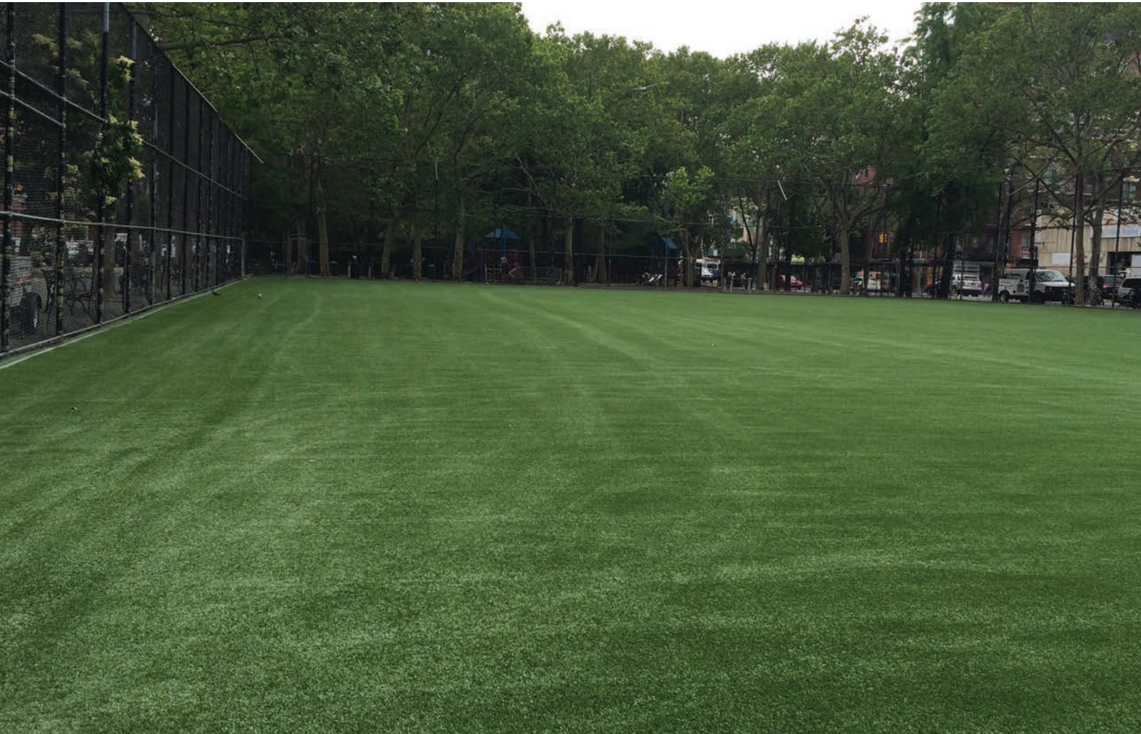
A-Turf® Titan SS field at a New York City park.