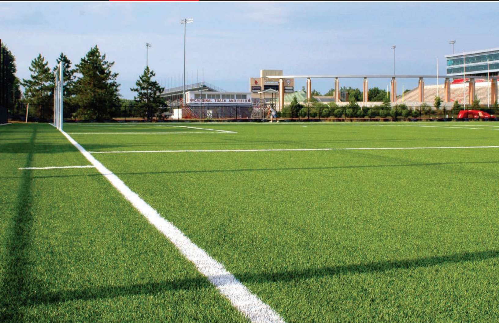
A-Turf® Mono soccer field at Ball State University – Muncie, IN.