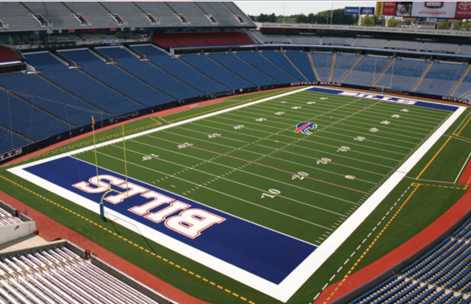
A-Turf® Titan field at Buffalo Bills' New Era Field – Orchard Park, NY.